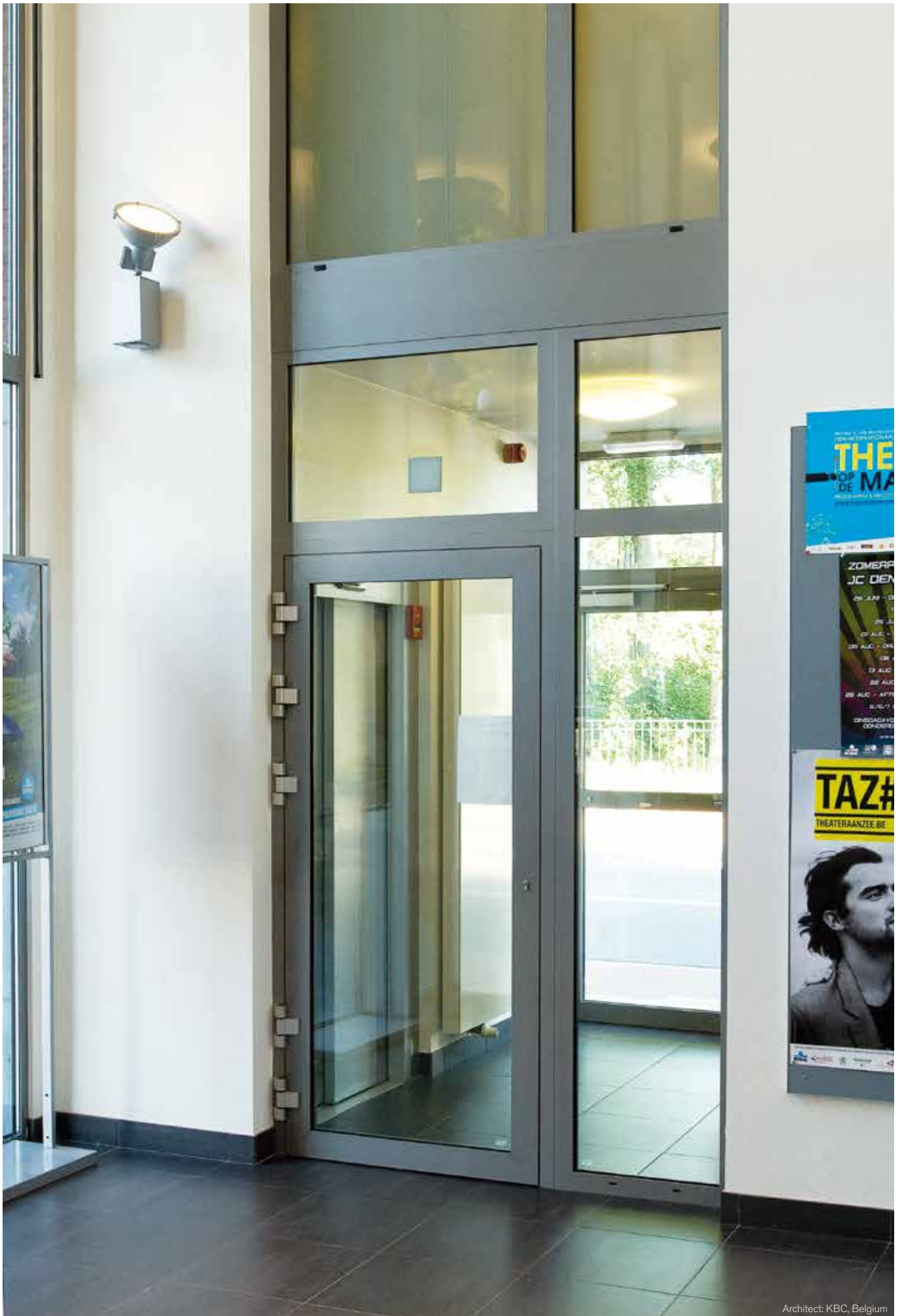
Architect: KBC, Belgium